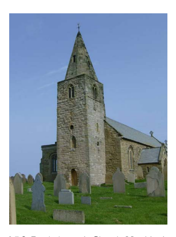
Figure 8.7 St Bartholomew's Church, Newbiggin (author)

Although Blyth and Amble had medieval antecedents, these settlements amounted to no more than small fishing villages, the main centres of population on this section of the coast being the new towns of Newbiggin, Warkworth and Alnmouth. All that remains of medieval Newbiggin is St Bartholomew's Church and the putatative traces of a hospital (referred to above). Only part of the failed Norman borough of Warkworth lies within the NERCZA study area. HER entries include the C14 bridge (NH 5411), the medieval gateway