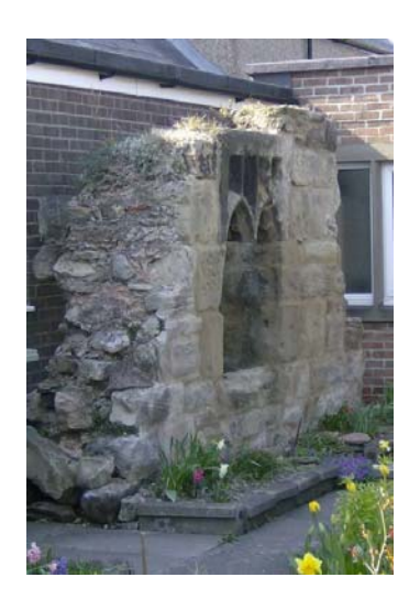
Figure 8.6 Fragment of the Amble monastic grange (author)