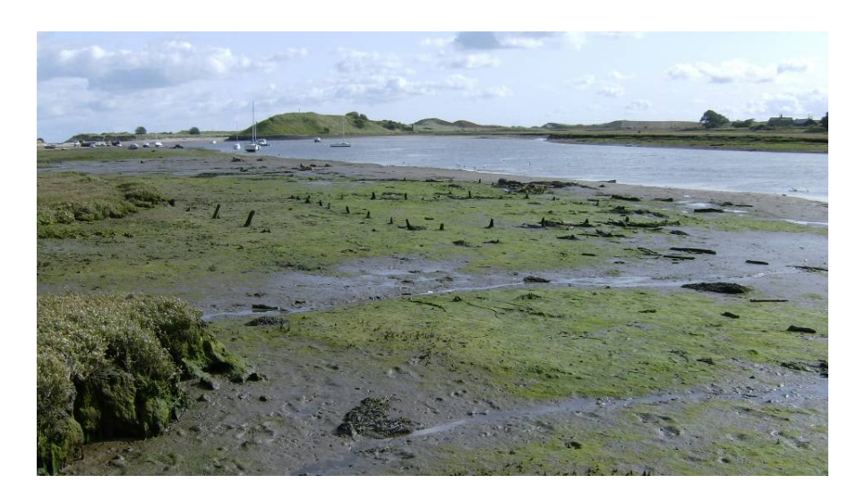
Figure 8.9 Oyster beds at Alnmouth

The area is being actively eroded by the river and the SMP1 data show the whole area to be at risk of flooding. It lies in SMP1 Unit 28 for which The 'Preferred Strategic Option' is 'Selectively hold the line'. It will be necessary to reconsider the situation once the SMP2 data become available.