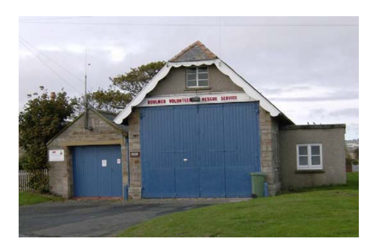
Figure 8.15 Boulmer Volunteer Rescue Service building

The HER records a lifeboat house at Cambois (NZ31198281, NH 18303) and a lifeboat station at Huxley (NU28580281, NH 20354). The Alnmouth Lifeboat Station consists of a pair of stone-built mid C19 buildings (NU25091075, NH 14178). They are both Grade II Listed Buildings.