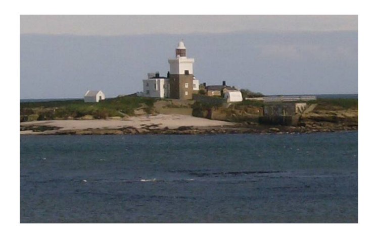
Figure 8.13 Coquet Island Lighthouse

The lighthouse (NH 5611, NU29300454) on Coquet Island was built in 1839-1841 incorporating the remains of a C15 tower which adjoined the medieval monastic cell. This influenced the shape of the lighthouse which is a square tower standing 21.9m high with a crenelated parapet. It is a Grade II* Listed Building.