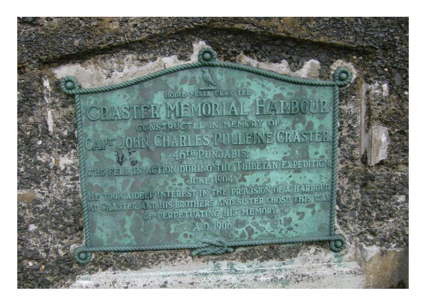
Figure 8.11 The memorial plaque at Craster Harbour

to Capt. John Craster who was killed during the 1904 Younghusband expedition to Tibet.