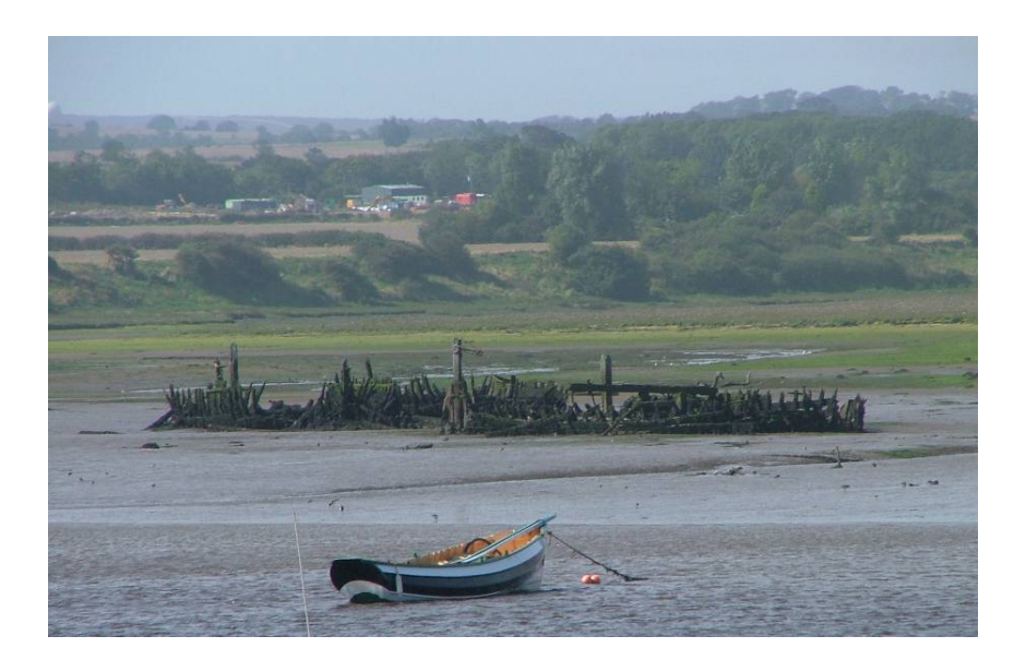
Figure 8.16 Wooden hulks on the north shore at Amble Harbour

The Amble hulks lie within SMP1 Unit 30 for which The Preferred Strategic Option' is 'Selectively hold the line'. It will be necessary to reconsider the situation once the SMP2 data become available but it is unlikely resources will be made available to protect these remains from the effects of rising sea level. A full survey should be considered an urgent priority.