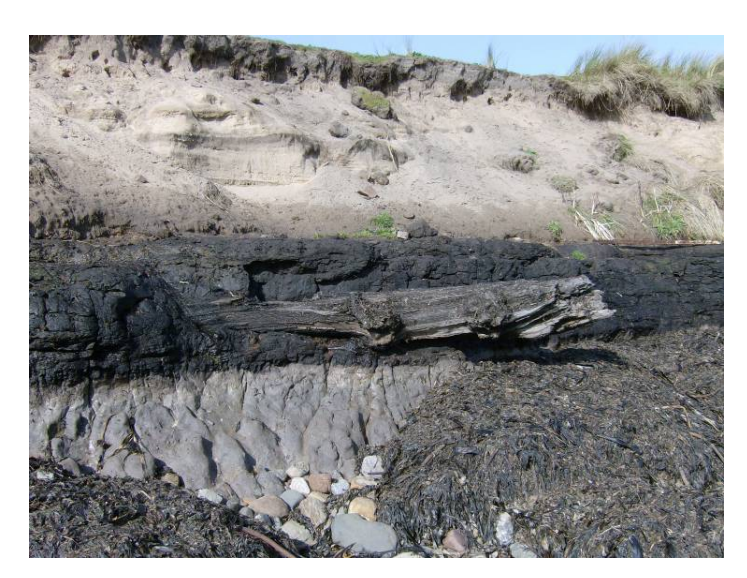
Figure 8.2 Peat and fallen tree trunk overlying boulder clay at Low Hauxley

the case of Cairn 2. The implication of this is that the dunes either began to form or reached their present position during the early 2^{nd} millennium cal BC. The importance of this situation cannot be overstressed. For a zone of about 8km the dunes at the head of Druridge Bay seal a land surface that was the focus of human activity from the 6^{th} to early 2^{nd} millennium cal BC and the potential for making significant discoveries is considerable but one seriously threatened by coastal erosion.