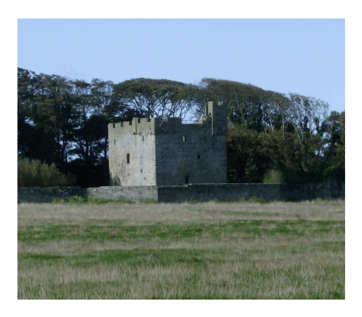
Figure 8.4 Cresswell Tower (author)

Lesser fortifications are represented by three tower houses . The most southerly is the C15 tower at Creswell (NZ29369335, NH 11924). It is a rectangular structure measuring 12.5m by 8.5m. Its consists of two floor levels over a vaulted basement while the present parapet and turret are probably C18 additions. It is roofless but otherwise well preserved. An C18 house formerly adjoined the tower on the north but this was demolished in the mid C19. The Cresswell Tower is both a Scheduled Ancient Monument and a Grade II* Listed Building.