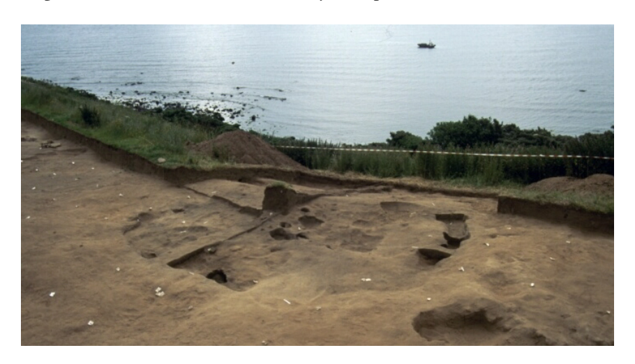
Figure 8.8 Site of the Mesolithic hut at Howick Burn

The fieldwalking programme at Howick led to the discovery of the Howick Burn occupation site (NU25851660, NH 5690). As well as an assemblage of 18,000 stone tools the excavation of this site uncovered the remains of a circular Mesolithic hut. This was partly sunk into the ground and although some of the structure had already been lost to erosion it was established to be about 6m in diameter. On the basis of radiocarbon dates obtained from successive hearth features, the construction of the hut has been dated to circa 7800 cal BC, which makes it the earliest dated evidence for human settlement in Northumberland. As well as stone tools, finds included charred animal bones and hazel nut shells and occasional marine shells, though the site should not be regarded as a midden . SLI and RSL data discussed in Chapter 3 indicate that at the time the Howick hut was occupied LAT was displaced horizontally by about 200m. This is unlikely to imply a wider foreshore as the cliff face can be expected to have lain farther east by an equivalent amount.