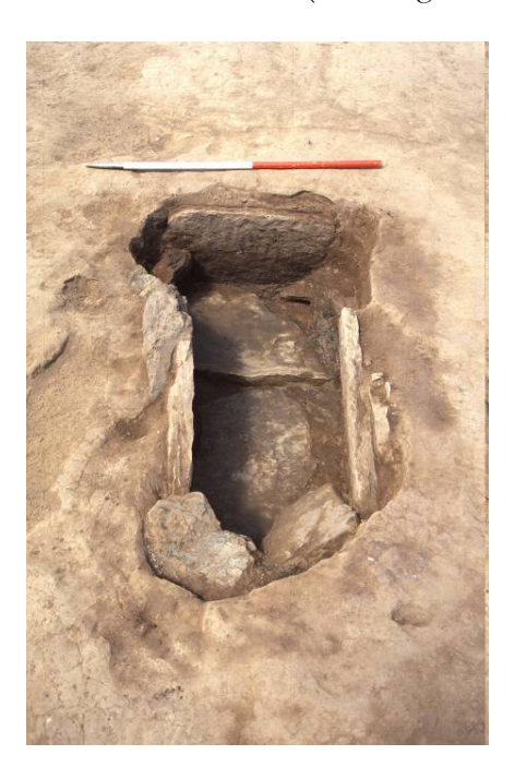
Figure 8.3 Bronze Age cist at Howick Burn (ARS)

five cists are considered to have been for infants, No. 2 containing fragments of a child's skull. Cist No.5 was adult size but no bone survived in the acidic soil. Fragments of a Food Vessel were associated with one of the other cists (Waddington et al 2005).