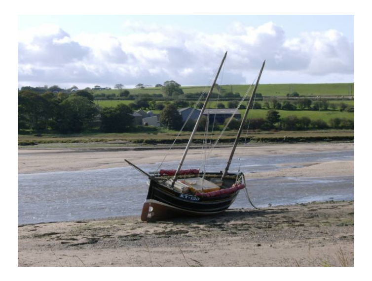
Figure 8.10 A vessel 'taking the ground' in Alnmouth Harbour

The estuary of the River Aln at Alnmouth was an important grain exporting port in the C16, C17 and C18. It lay at the far end of the 'Alemouth Road' which ran from Hexham and through Rothbury. The grain trade at Alnmouth is evidenced by many fine stone built granneries which line Northumberland Street but the port never developed any formal harbour works, vessels simply either anchored in the river or took the ground at low tide.