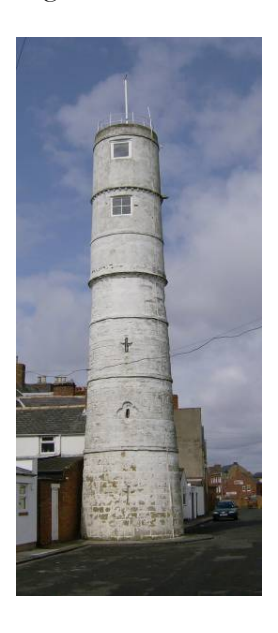
Figure 8.14 The High Light at Blyth

modern navigational aids. The High Light is a Grade II Listed Building.