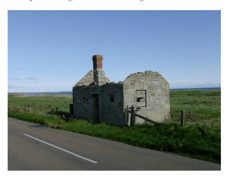
Figure 8.18 Pillbox S0007011 Druridge Bay Defence Area

• This pillbox is disguised as a ruined cottage