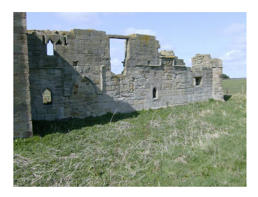
Figure 8.5 Low Chibburn C14 Preceptory (author)

As mentioned in the previous section, there is documentary evidence that St Waleric's Church at Alnmouth was not the first church on that site and that when William de Vescy established the new town at Alnmouth it was only necessary to enlarge an existing building, though in effect this appears to have been a virtual rebuilding. This is recorded as taking place between 1170 and 1190. Few details survive as the church was destroyed during the storm of 1806 which altered the course of the river and cut St Waleric's off from the rest of the town, though C18 engravings show that it was already ruinous by then. These engravings, which have been studied in detail by Bettess and Bettess (2004, 60-64), indicate a large building consisting of a nave, transcepts and chancel. Nothing now survives above ground level and some of the site has been lost to erosion.