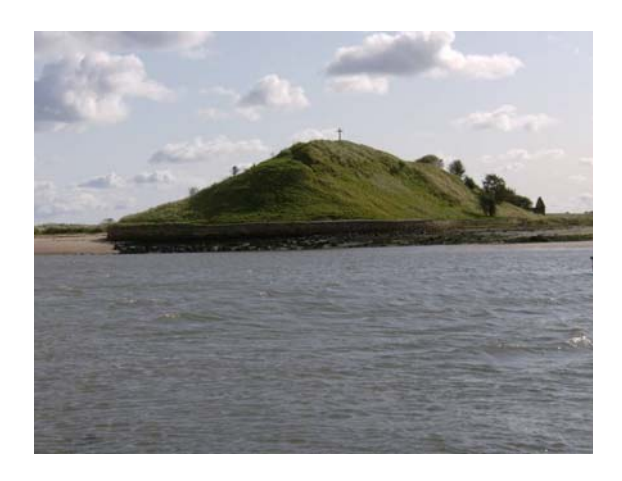
Figure 8.1 The site of St Waleric's Church, Alnmouth

Coquet Island lies about 2km to the east of Amble Harbour. It measures 0.35km N-S and 0.15km E-W but is over twice this extent at LAT. It slopes gently W-E from 10m OD to 2m OD. The geology of the island is Coal Measures sandstones capped by boulder clay on which has formed a loam soil.