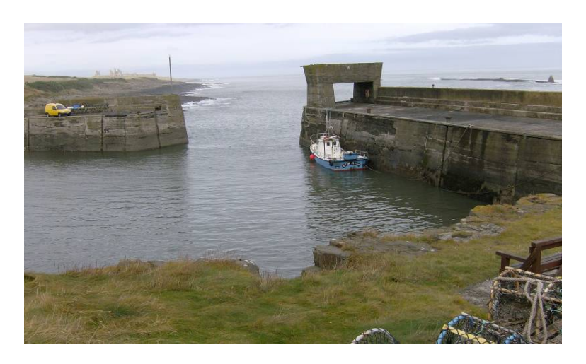
Figure 8.12 Craster Harbour (author)

The harbour works consist of a concrete North Pier extending 64m to the SE and a concrete South Pier which runs for 60m NE and then a further 70m due north towards the North Pier, leaving an entrance about 45m wide. At low tide the harbour dries out. The harbour was constructed mainly for the shipment of whinstone from the nearby quarries, though it also served the fishermen who had used the haven for centuries.