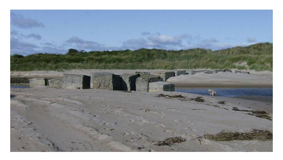
Figure 8.19 Anti-tank blocks in the Druridge Bay Defence Area

The foreshore was protected by a continuous line of anti-tank blocks set within and at the foot of the dunes while to the rear of the dunes was a continuous anti-tank ditch. The blocks can be found almost anywhere while a section of anti-tank ditch survives to the north of Druridge Farm.